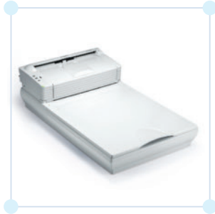
Full-Size Flatbed Unit For DR-2580C

Item Number: 0106B001 Dimensions (H x W x D): 6.1" x 12.4" x 21.9" Weight: 8.4 lb. (Approx.)