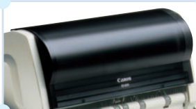
ED-600 Endorser for DR-9080C/7580

Endorser Position Dials: Adjusts the Endorser Position Vertically Endorsement Area Checks: 1.10" - 2.56" Letter: 1.22" x 10.67" Stamping Plates (W x L): 1.18" x 1.57" Dimensions (H x W x D): 7.2" x 13.39" x 6.06" Weight: 9.48 lb. w/PSU (Approx.) Endorser ED-500 w/ Die Drum B110: 3649A001 Die Drum B110 w/ 8-Digit Dater: 3654A003 Ink Roller, Black: 6331A001 Ink Roller, Red: 6334A001 Ink Roller, Purple: 6333A001 Ink Roller, Green: 6332A001