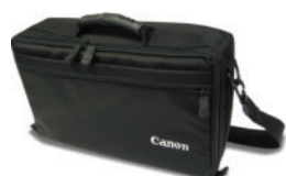
DR-2050C/DR-2050SP Soft Carrying Case

Item Number: 1029V680 Dimensions (H x W x D): 15.5" x 4.5" x 9" Weight: 2 lb. (Approx.)