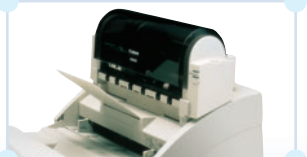
ED-500 Endorser for DR-3080CII

Item Number: 0837B002 Imprinter Side: Back Dimensions (H x W x D): 11.1" x 19.2" x 7.3" Weight: 18.7 lb. (Approx.) Ink Tank 50, Black: 0836B001 Ink Tank 50, Red: 0836B002