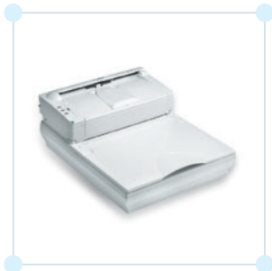
Half-Size Flatbed Unit For DR-2580C

Item Number: 0106B001 Dimensions (H x W x D): 6.1" x 12.4" x 21.9" Weight: 8.4 lb. (Approx.)