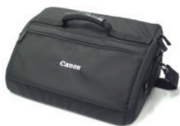
DR-3010C/ScanFront 220/220P Soft Carrying Case

Item Number: 1191V396 Dimensions (H x W x D): 12" x 6" x 7" Weight: 2 lb. (Approx.)