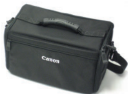
DR-2510C/DR-2010C Soft Carrying Case

Item Number: 1129V241 Dimensions (H x W x D): 13" x 9" x 14" Weight: 4 lb. (Approx.)