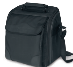
DR-3080CII Soft Carrying Case

Item Number: 0676V383 Dimensions (H x W x D): 2.75" x 14.5" x 7" Weight: 4 lb. (Approx.)