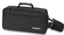
DR-2580C Soft Carrying Case

Item Number: 1029V680 Dimensions (H x W x D): 15.5" x 4.5" x 9" Weight: 2 lb. (Approx.)