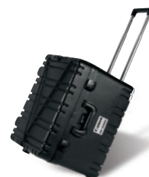
DR-3080CII Hard Carrying Case

Item Number: 1363V016 Dimensions (H x W x D): 8" x 12" x 15" Weight: 2 lb. (Approx.)